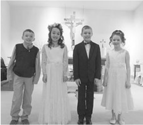
1st Eucharist Celebrations that took place last weekend at St. Philip and St. Mary