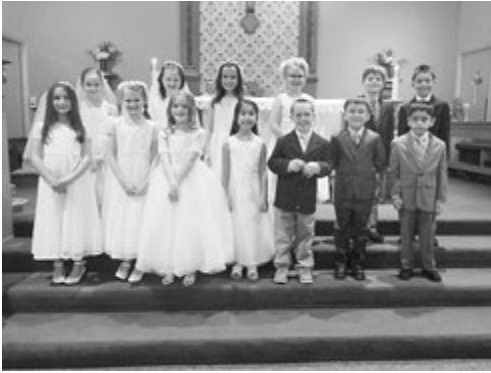
1st Eucharist Celebration last weekend at St. Mary Church.